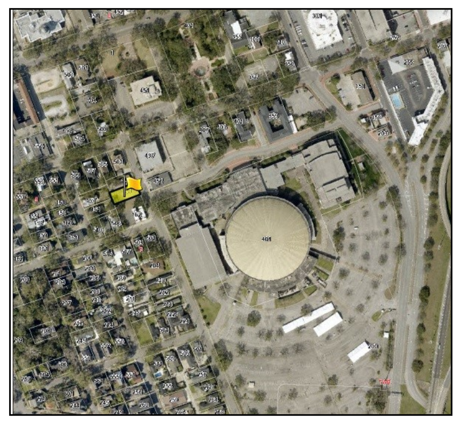
The information provided for by the company is subject to errors, omissions, changes, prior sale or lease and withdrawal from the market without notice by the owner. This information has been gathered from sources that are deemed to be reliable, however there is no warranty or guarantee to its accuracy or validity. You are hereby advised to independently verify the information presented herein.